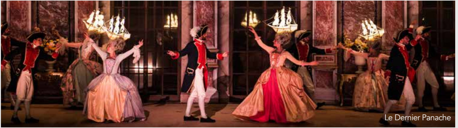
Le Dernier Panache