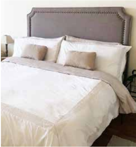
The Corner Noirmoutier en l'île