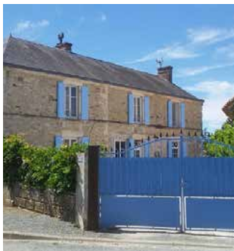
La Maison de Thiré Thiré