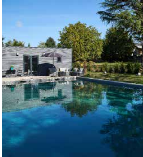
Le Céladon Montaigu

2 Rue du General Leclerc Noirmoutier en l'île www.thecorner-no.fr