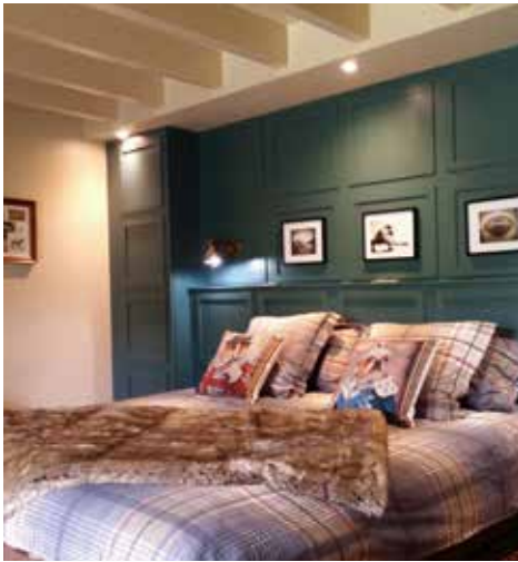
Le Logis du Grand Moulin Les Epesses