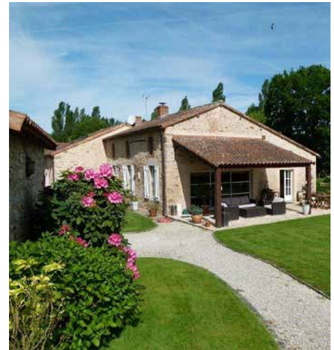
L'Etang Neuf Sèvremont

16 rue du Maréchal Ferrant - Les Herbiers les4chenes.fr