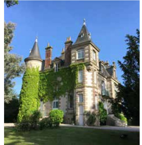
Le Château des Tourelles La Gaubretière

13 Place du Champ de Foire - Montaigu www.le-celadon.fr