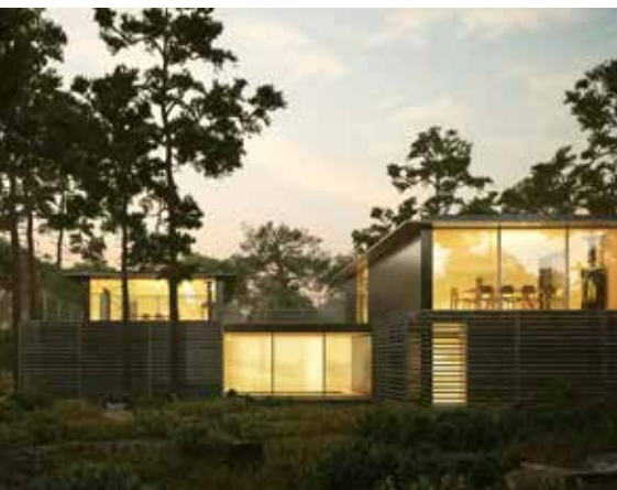
Impasse de Cayola - Talmont Saint Hilaire www.francedurez.com