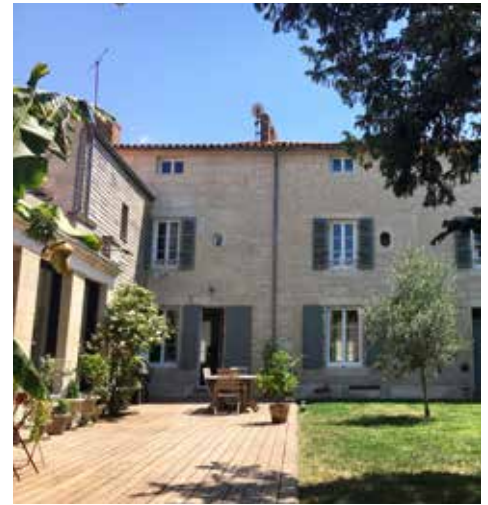
L'Esprit des Lieux Luçon

19 Rue Jacques Charles Guichet Breuil-Barret lamaisondupinier.fr - www.lescapehouse.fr