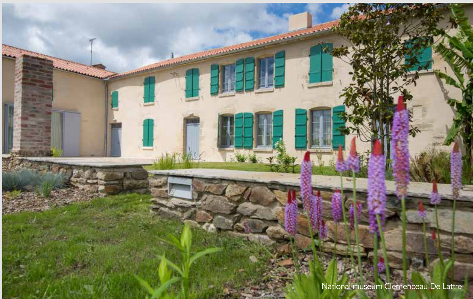
National museum Clemenceau-De Lattre