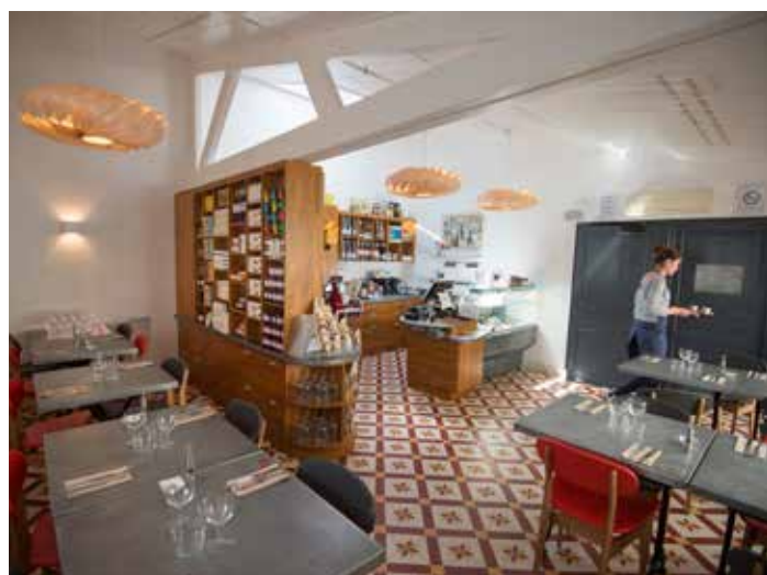
L'assiette au jardin 9 rue du Robinet - Noirmoutier en l'Île Facebook : L'Assiette au jardin