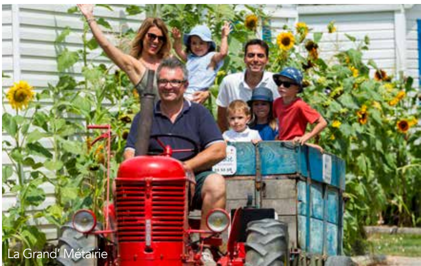
La Grand' Métairie

La Grand' Métairie**** 8 Rue de la Vineuse en Plaine - Saint Hilaire la Forêt www.la-grand-metairie.com