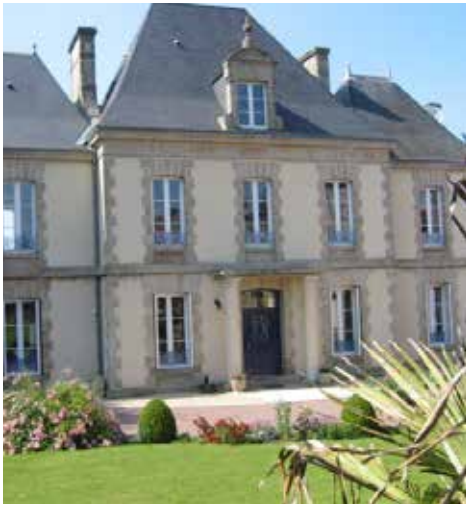
Château La Pierre Levée La Gaubretière