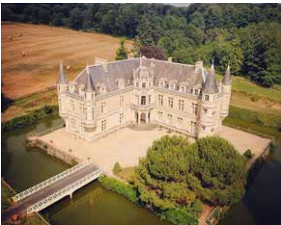
14 rue du château - Bourneau chateaubourneau.com