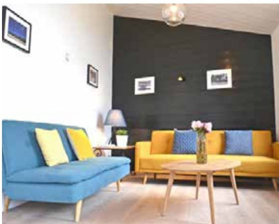
3 ter rue de la Croix Champion Noirmoutier en l'Île