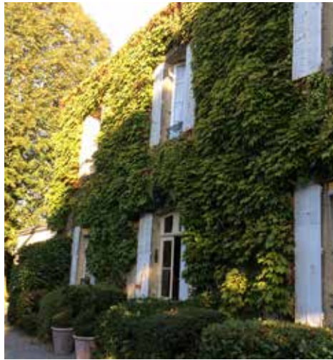
La Maison du Pinier Breuil-Barret

37 rue Jacques Forestier - La Gaubretière www.chateaulapierrelevee.com