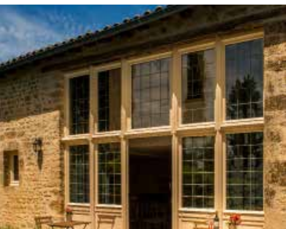
4 Le Retail - Saint Hilaire des Loges www.chateauleretail.com