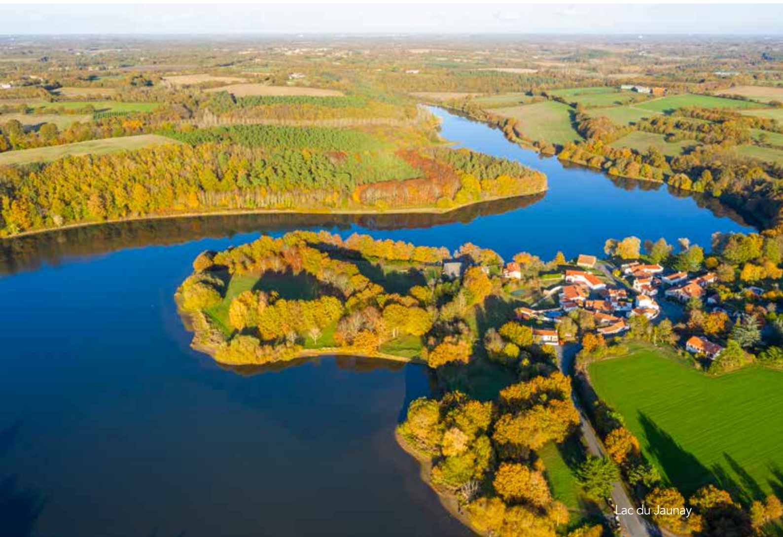
Lac du Jaunay