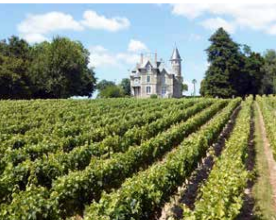
La Brédurière - Moutiers sur le Lay www.chateau-breduriere.com

In the Vendée countryside, near the forest of Mervent, you will find the small Château Le Retail, transformed into a charming holiday home ready to accommodate up to 6 guests. The main house dates back to 1341, some exterior features and a medieval vaulted cellar date back to the 11 th century. More than just a gite, visitors benefit from spacious, tastefully decorated accommodation and tailor-made services for birthdays, dinners and picnics. The house has 3 bedrooms each with a bathroom and private toilet.