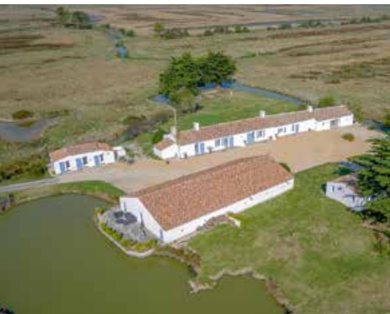
La Grande Borderie Saint Gervais www.lesgitesdelagrandeborderie.com