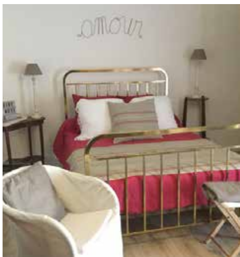
A l'intérieur de la Grange Luçon