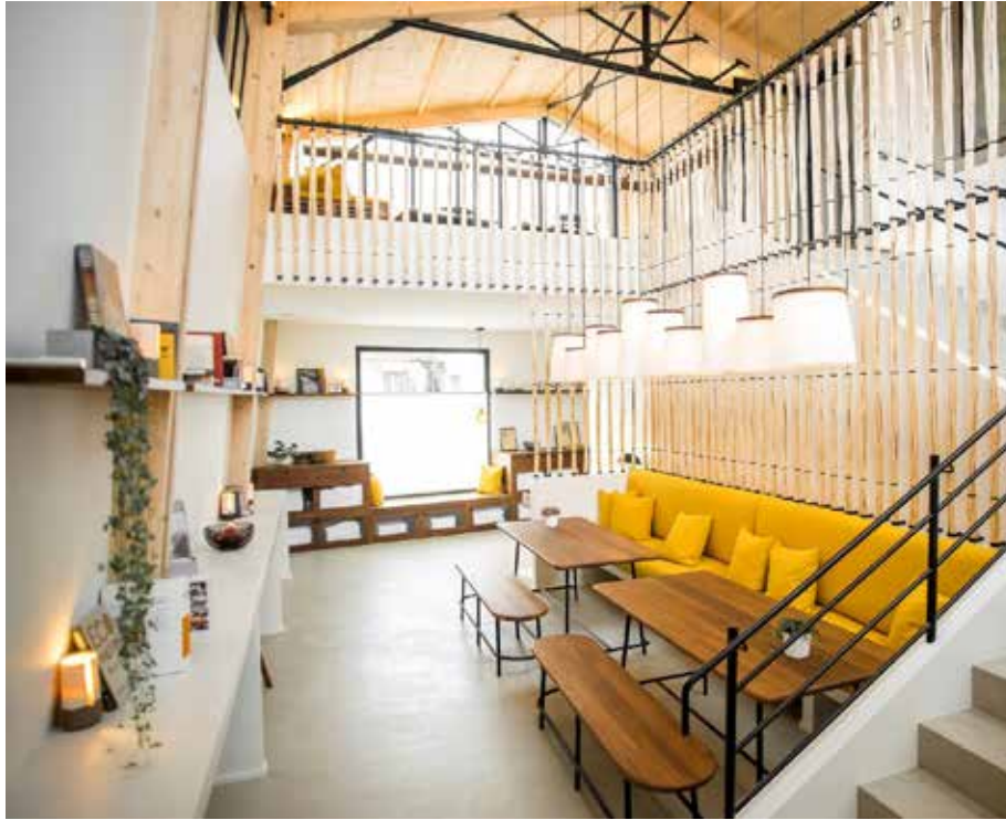
5 rue Marie Lemonnier - Port de l'Herbaudière Noirmoutier en l'île www.alexandrecouillon.com