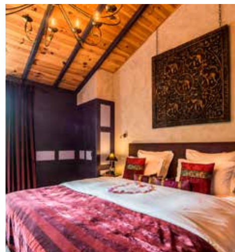
Le Portail en Marais poitevin Moreilles