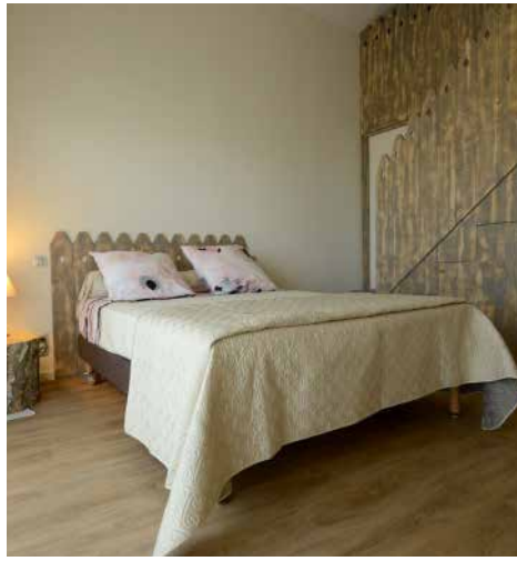
Les 4 chênes Les Herbiers

Lieu-dit "Le Grand Moulin" - Les Epesses www.logisdugrandmoulin.com