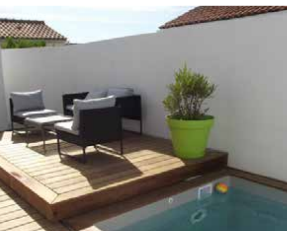
Le Vieil – Noirmoutier en l'Île

This stylish and bright holiday home seduces you from the start with its trendy decoration. Located 600 meters from the village of Noirmoutier en l'Île, 1.6 km from the beach of Clère and near the Bois de la Chaise, its location offers several routes to explore the area on bikes or on foot. On the ground floor, the house has a kitchen open to the living room, a sitting area, two bedrooms, a bathroom and separate toilet. Upstairs, there is a bedroom with 4 single beds 2 of which are bunk beds and a bathroom with toilet. To relax in fine weather, before a swim in the sea, guests can enjoy the wooden deck overlooking a walled garden.