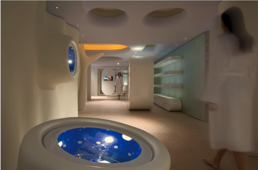
Boscolo Exedra Nice