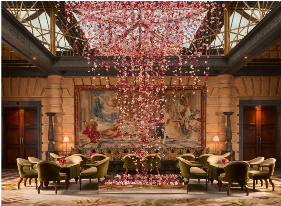
The Metropole Monaco