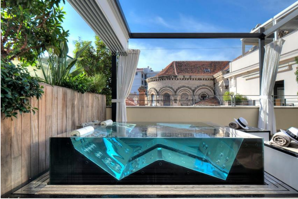
Five Sea Hôtel – Cannes