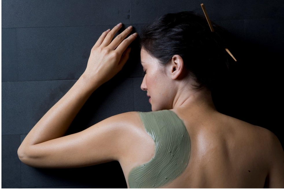
Les Thermes Marins de Cannes