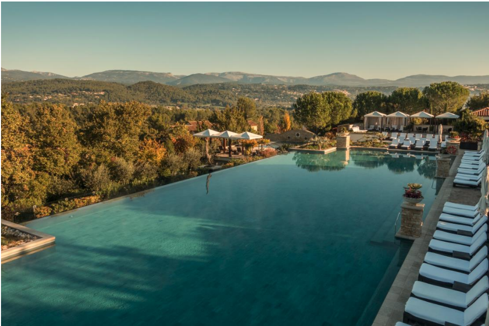
Terre Blanche - Tourrettes