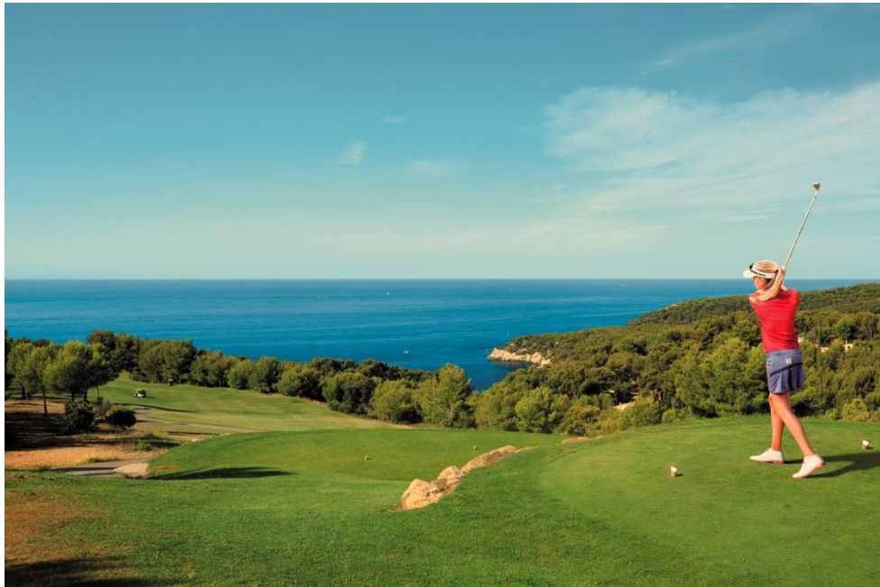
Golf Dolce Fregate|Provence

This new pass gives you access to no fewer than 18 golf courses scattered around the Côte d'Azur, from the Alpes-Maritimes to the Var via Nice and the greater Toulon region. The pass aims to act as an ambassador for the region's golfing heritage and promote the vibrant and historic golfing scene here.