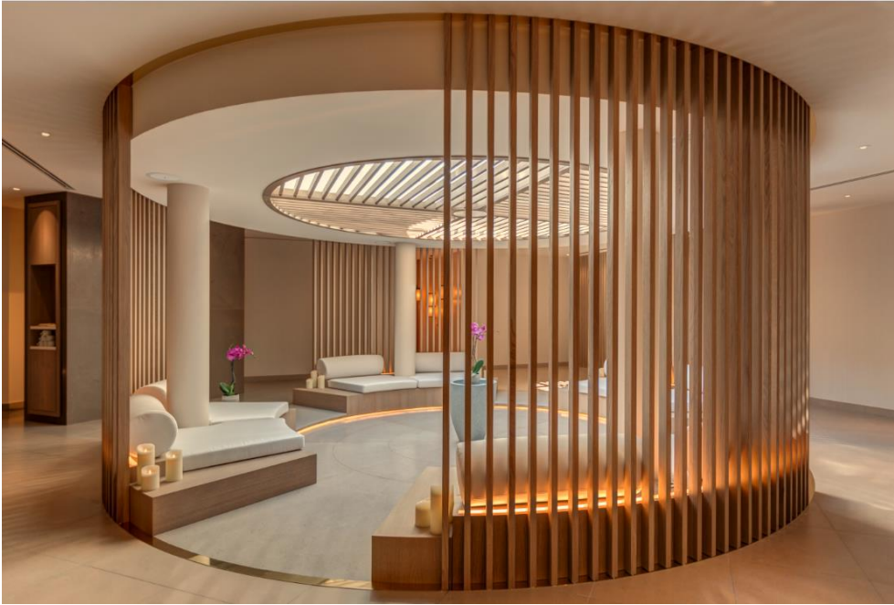
Le Monte Carlo Bay — Spa Cinq Monde