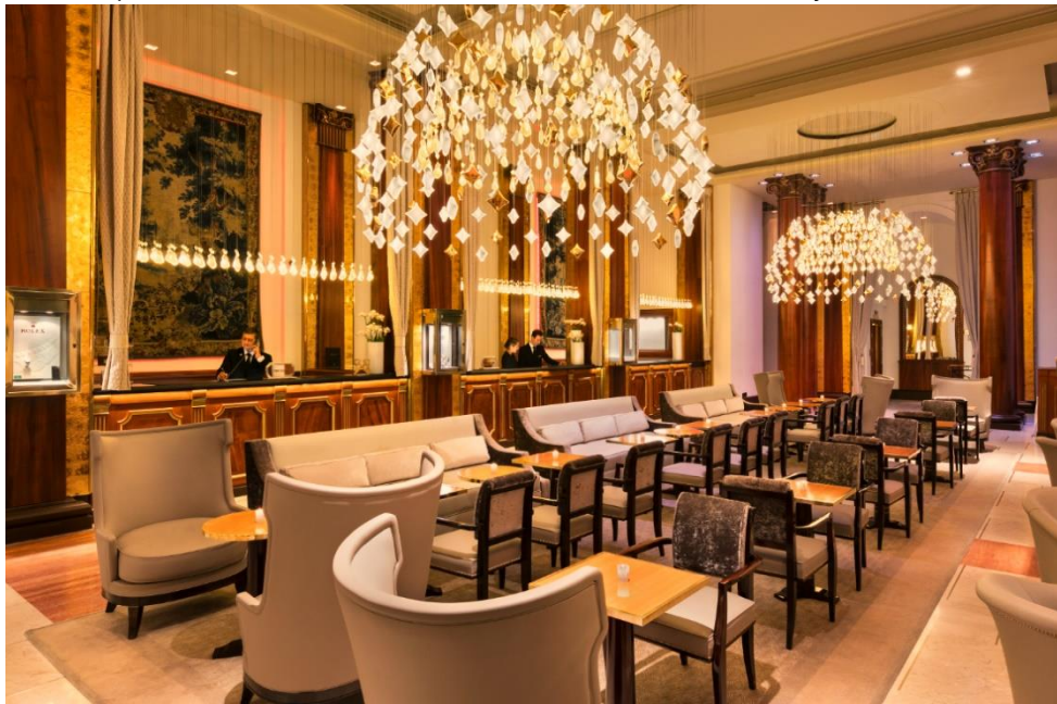
Majestic Barrière Cannes