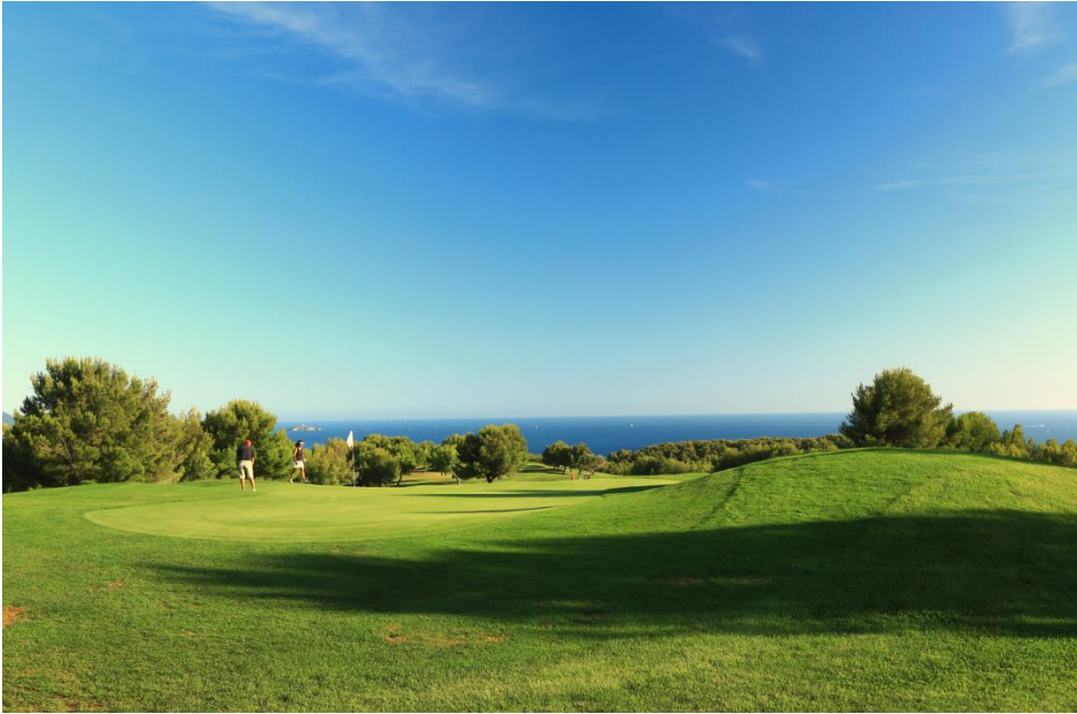
Dolce Frégate Provence — Bandol [Var]