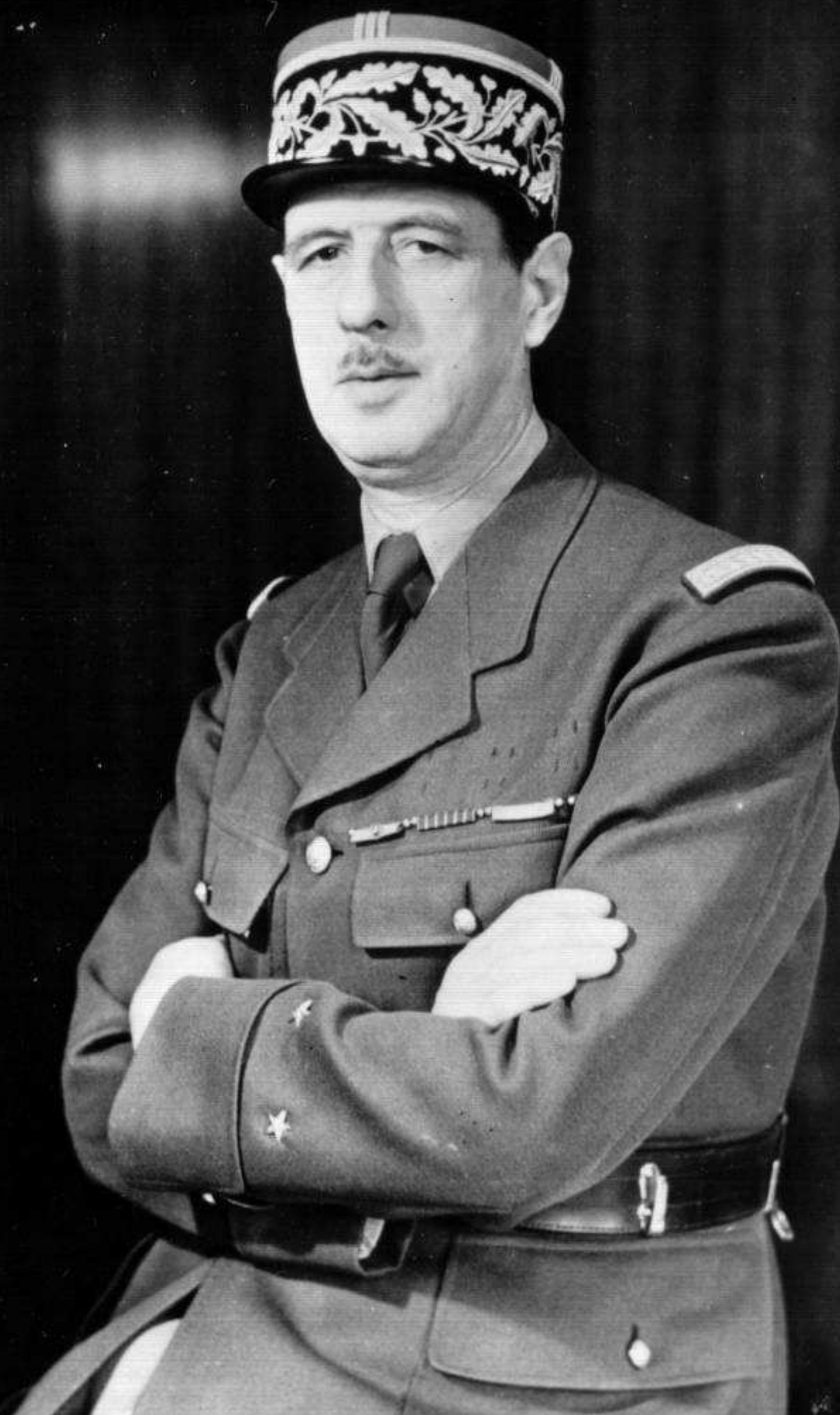
General De Gaulle.