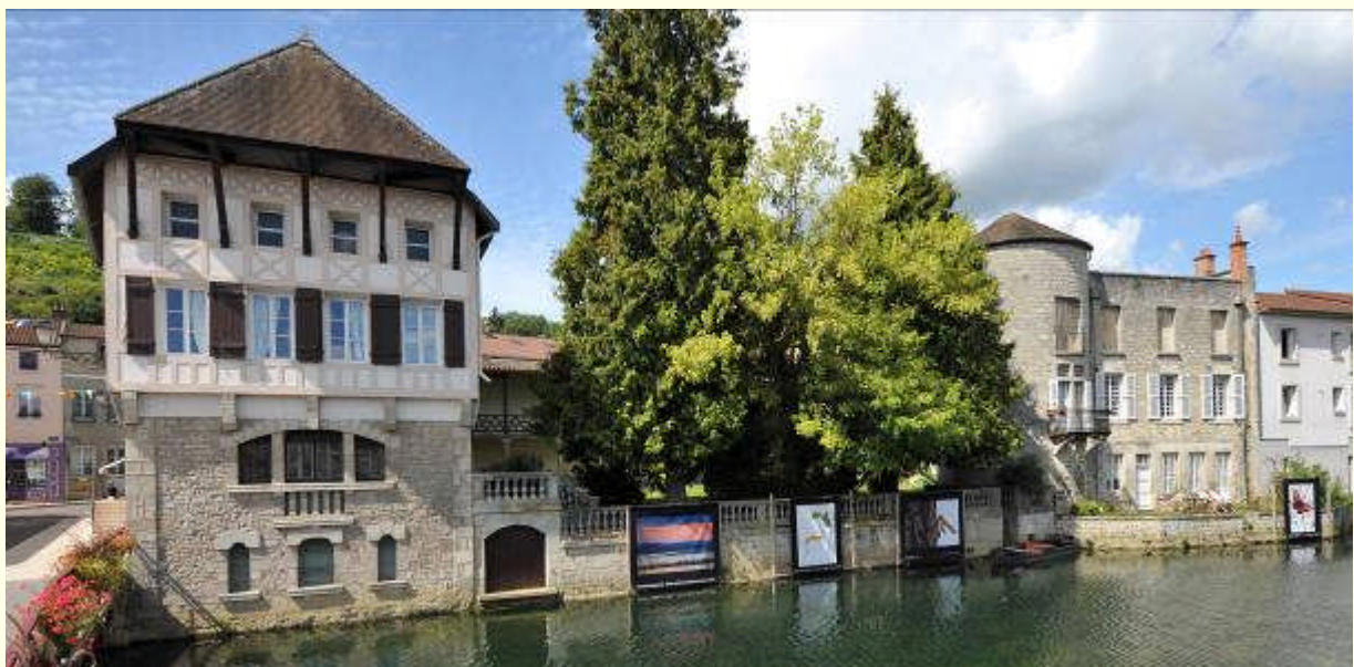
'Quai des Peceaux' in Joinville.

The Renaissance city of Joinville invites to walk through its tiny streets and discover its old houses nestled against the hill of the old castle that was once the cradle of the Lords of Joinville. The 'Quai des Peceaux' which borders the "Little Venice", the 'Quai des Mailles' or the 'Poncelot' bridge promise beautiful strolls. The old pharmacy is located and tells the story of Joinville Hospital.