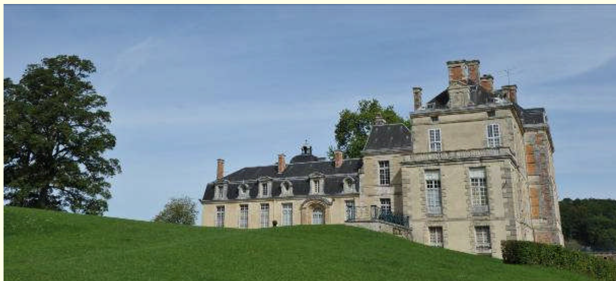
The castle of Cirey-sur-Blaise where Voltaire lived from 1734 to 1749.

At the heart of the Blaise Valley, here still stands the castle of Cirey-sur-Blaise where Voltaire stayed along from 1734 to 1749 with the marquise Emilie du Châtelet. The famous philosopher found refuge there following the controversy publication of "English Philology".