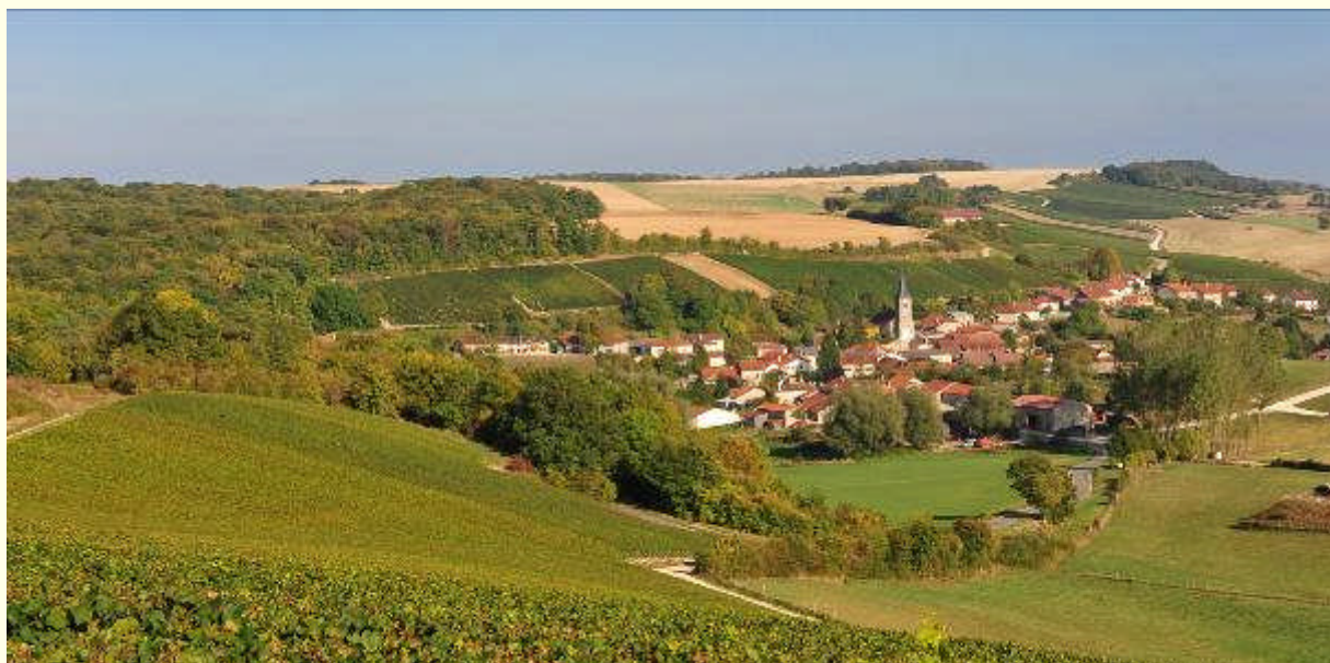
The vineyard of Haute-Marne Champagne covers over 80 hectares in the North-West of the Department.

Cellier Saint Vincent Tel. : +33(0)6 61 88 52 82