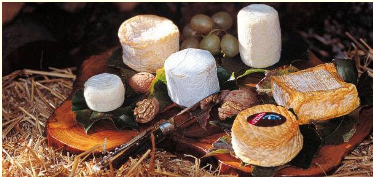
Many varieties of cheese are produced in the Haute-Marne including the famous Langres' cheese. (the first one on the left-top corner on the picture).