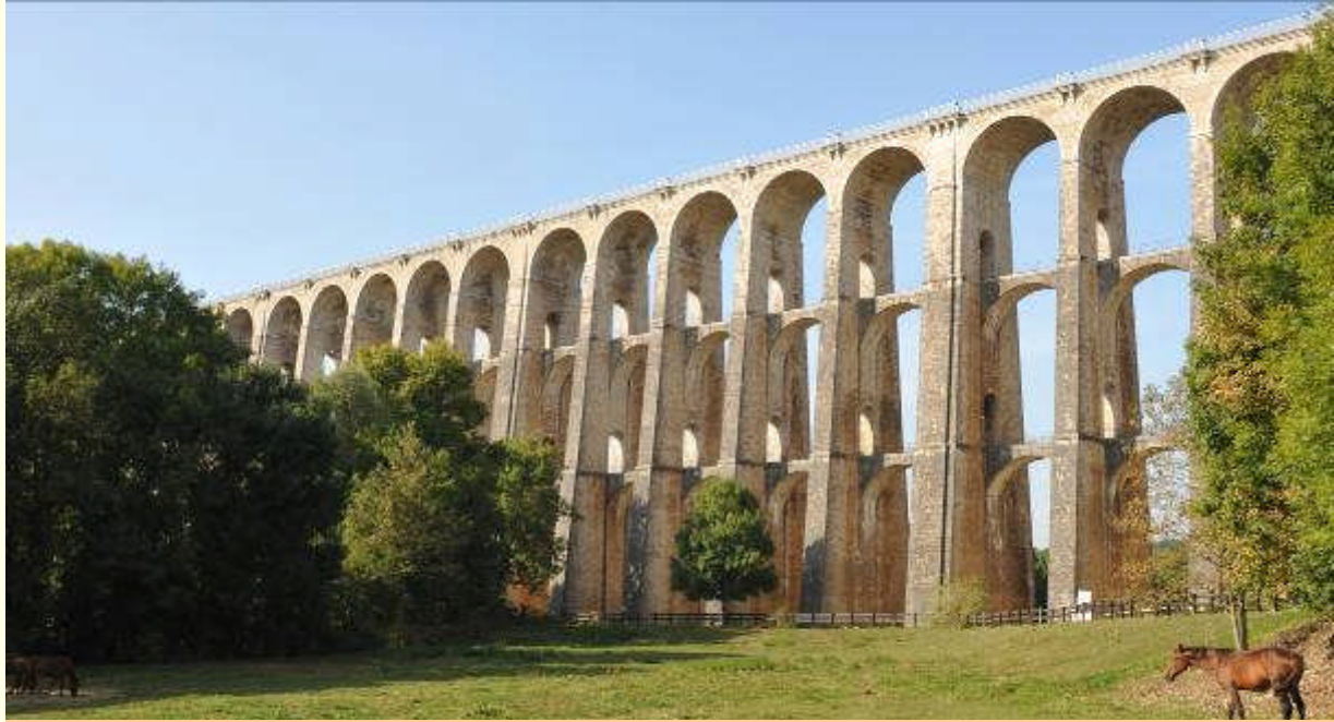
The impressive Viaduct in Chaumont.

The city of Chaumont - with feudal origin and former residence of the Counts of Champagne that radiated throughout the region - early received a strategic position. The only remains of this period are the dungeon which served the Lord and housing for soldiers, and some of the walls. But the impressive viaduct remains the biggest heritage of the city and is still used today.