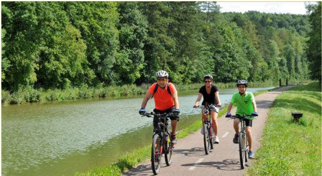
Haute-Marne counts various roads for the pleasure of cyclists.

For more information about these labels: www.tourisme-champagne-ardenne.com