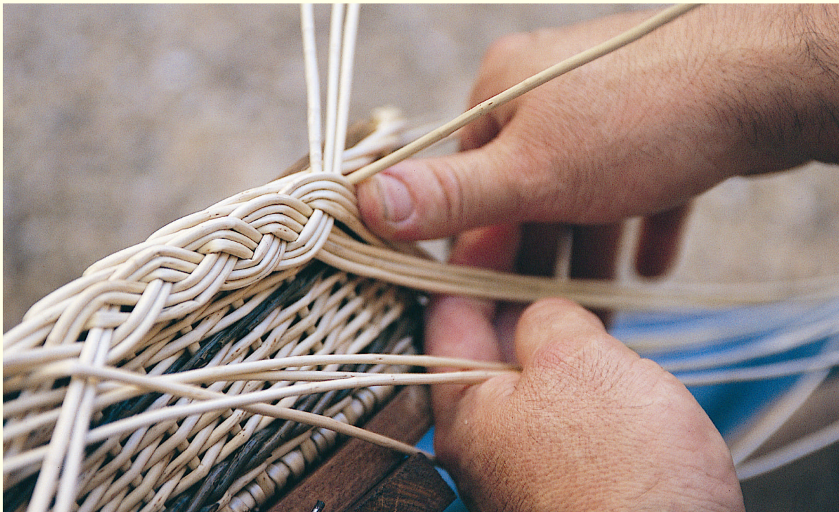
The basketry is an historical and typical know-how of the Haute-Marne..