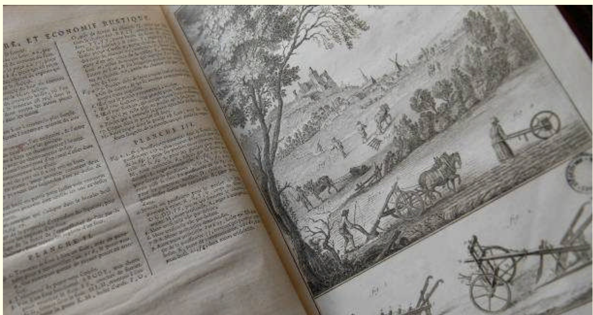
Overview of the Encyclopedia.

Son of a well-known cutler master, he studied at the Jesuit School. At the age of 15, he rejects the estate of his father and canonical seat of his uncle and left the city to pursue his studies in Paris at Louis-le-Grand High School. In 1746, he was asked to translate an English encyclopedia published in 1728. Then, the idea came to him to recompose this document which makes him that famous. His statue, carried out by Bartholdi in 1884, presides over the main square of the city.