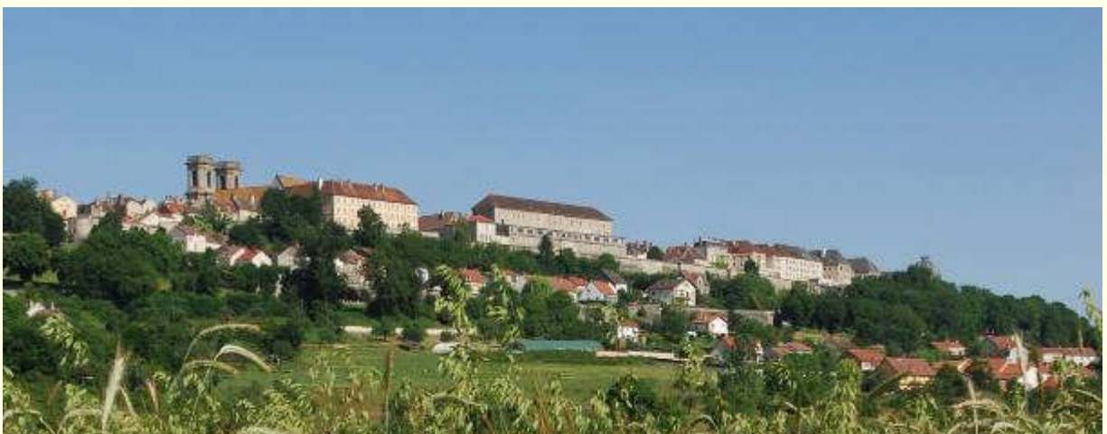
The fortified city of Langres.