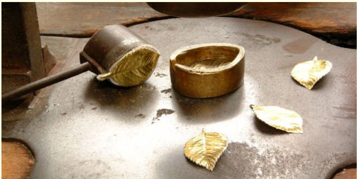
Creating decorative flowers and leaves is the core expertise of the Floristry Mill.