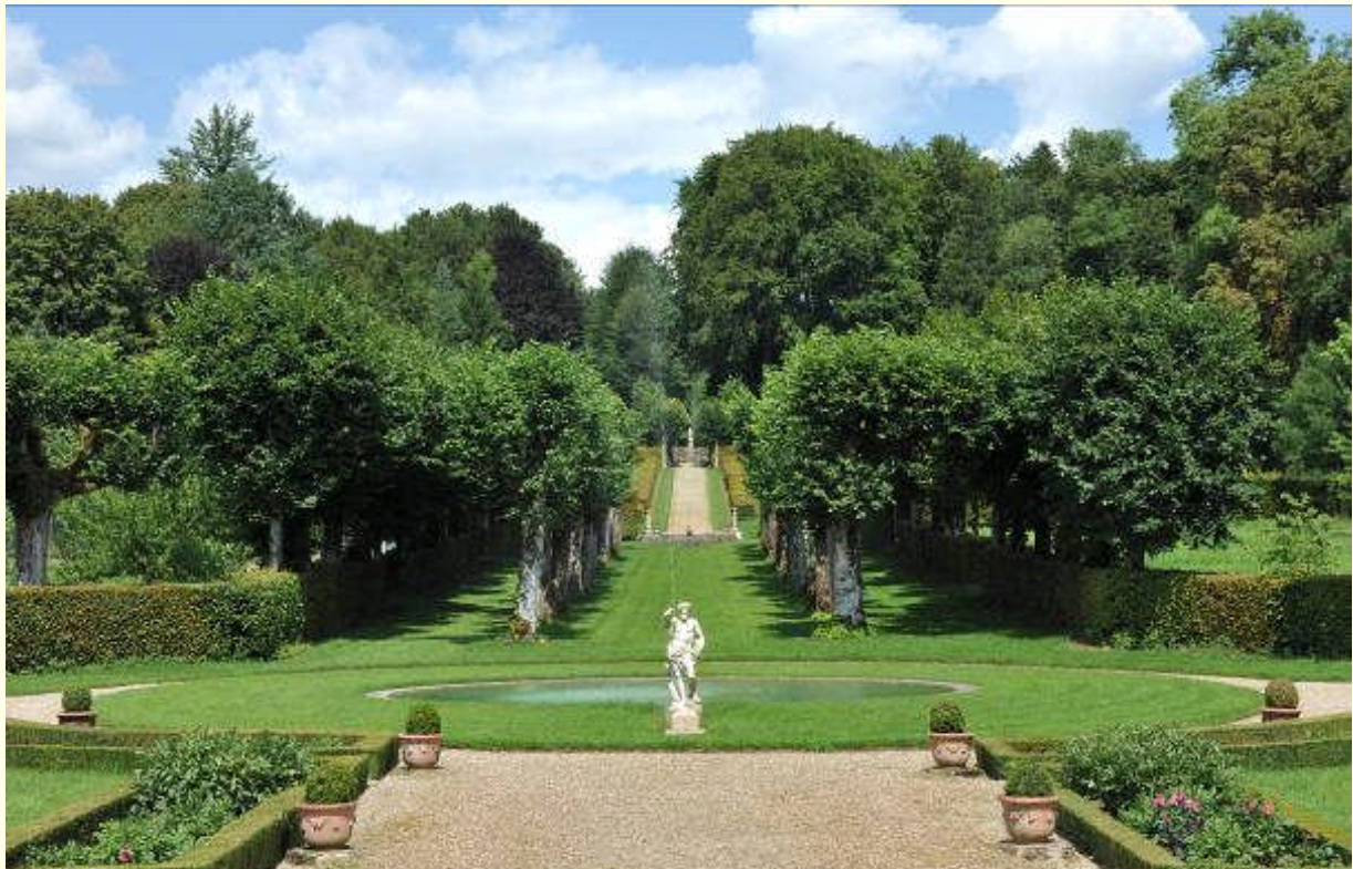
A perfect example of Classical garden with the Silières' garden in Cohons.

Les jardins de Silière 14, rue Candrée 52600 COHONS Tel. +33 (0)6 10 74 10 70 www.siliere.fr