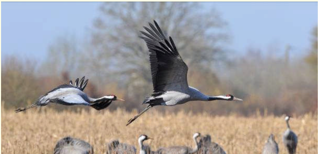
The flight of common cranes is always a spectacular moment.

With its quality environment, the 'Lac du Der' has become a mecca of French ornithology and attracts specialists from all countries. Over 270 bird species have been recorded in the area wintering, migratory or breeding. Although artificial, the reservoir is classified bird sanctuary since 1978. Some are rare and endangered. It also has 40 species of mammals, 45 varieties of dragonflies, 20 kinds of amphibians and more than 200 different plants.