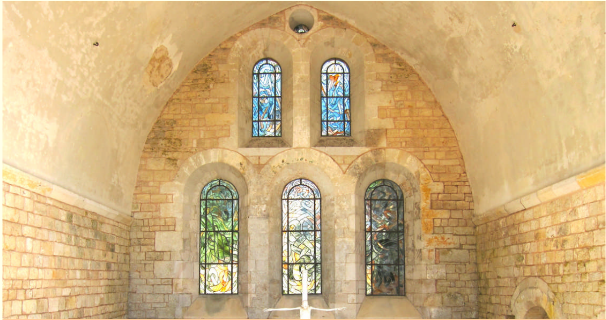
Old medieval part of the Abbey of auberive

In 2015, Bernard of Clairvaux, a leading promoter of the Cistercian order, celebrates its 900 years. Haute-Marne holds seven Cistercian abbeys in its territory. Among them, the abbey of Morimond , 4 th daughter of Clairvaux (First Foundation), is located in Parnoy-en-Bassigny. Founded in 1117, it remains to this day the gatehouse, the Chapel and a section of wall of the abbey church.