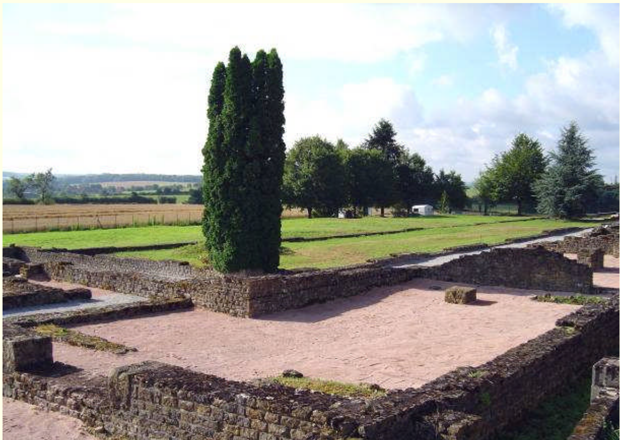
The Roman Villa of Andilly-en-Bassigny.