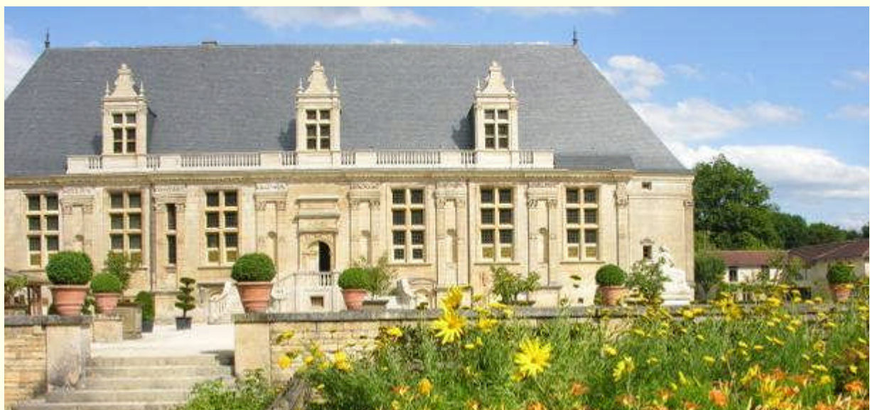
The Renaissance Castle of Joinville.

Château du Grand Jardin 5, avenue de la Marne 52300 JOINVILLE Tel. +33 (0)3 25 94 17 54 www.haute-marne.fr/legrandjardin