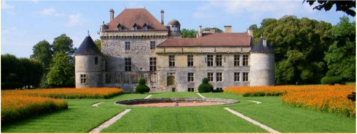
Castle of Pailly.

The Castle of Pailly is an example of Renaissance architecture among the most remarkable. Located on the site of an old feudal fortress, which it probably kept the dungeon and three corner towers. However, exterior facades have kept appearance somewhat martial of a military building. The set is surrounded by moat and inside the castle we can find large halls and richly ornamented monumental fireplaces.