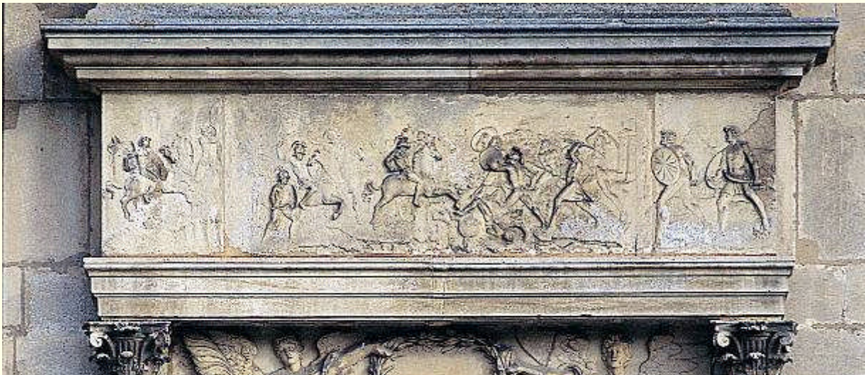
A detailed part of the front door of the Renaissance Castle of Joinville.

Association des amis du Château Lafauche Tel. +33 (0)3 25 31 57 83 www.chateau-lafauche.com