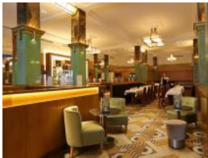
Les Grandes Brasserie du Groupe Flo

If you prefer sweet-savory notes, you should try the 100% chocolate-based recipes of Un dimanche à Paris , a new concept store and restaurant that also offers cooking classes.