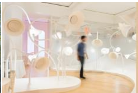
Le Grand Musée du Parfum