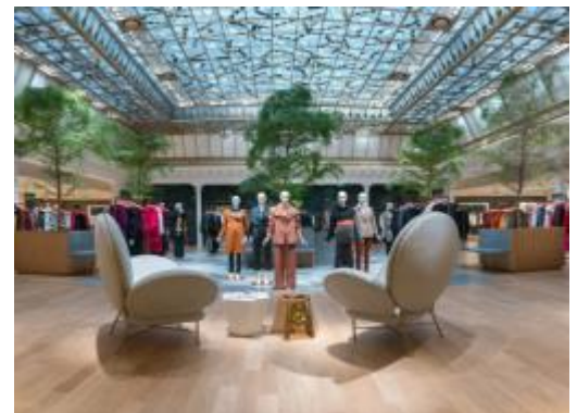
Le Bon Marché