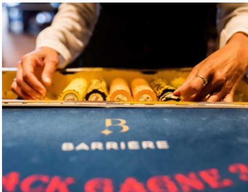
Casino Barriere - Enghien les Bains

With music, dance, street art festivals and more, Paris hosts a growing variety of celebrations like the Rock en Seine festival . The landscape of festivals is also being renewed, with an emphasis on urban cultures.