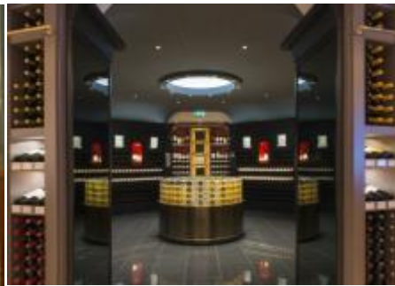
Les caves du Louvre