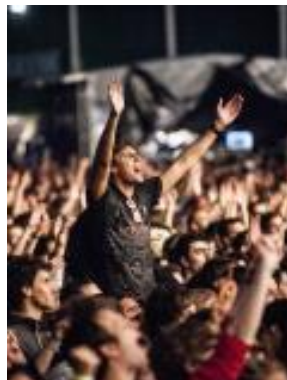
Rock en Seine