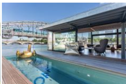
Hôtel OFF Paris Seine****