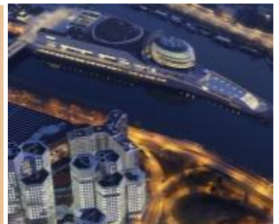
La seine musicale